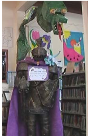
Sir Read-a-lot stands guard with a fire breathing dragon at Bill Library

In addition to the reading programs, we had a Sidewalk Chalk Contest, Preschool Story time, Wizards Kings and Things, Jack the Court Jester, castle crafts, Lego castle contest, and a fun play by the Marshmallow Masquers for our finale.