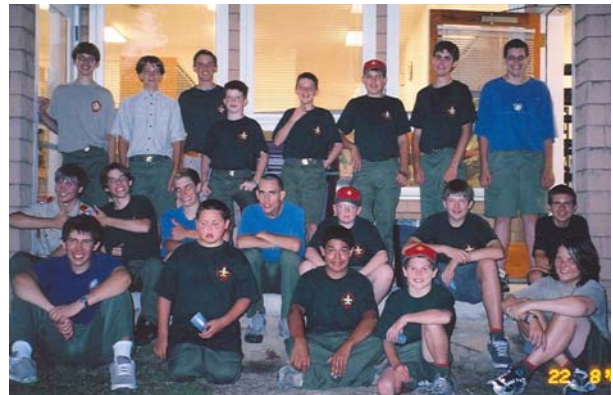
Boy Scouts from Troop 16 take a break after helping to set up for the book sale at Bill Library.

The on-going book sale at Bill Library also did well this year earning $2,400 for the Friends. It is through the efforts of a small group of Friends and many volunteers that we have been able to have 3 successful book sales this year, as well as, ongoing book sales and the Mistletoe Craft and Bake Sale, Yule Tea and Ledyard Sampler. All of these events raise money to benefit the Ledyard Libraries.