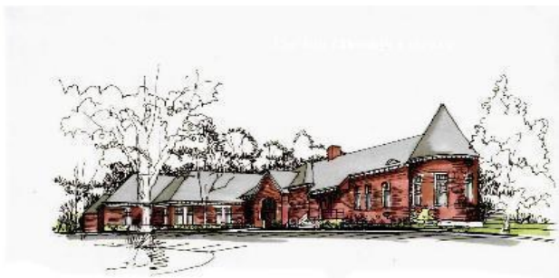
The Bill Library View of Main Entrance