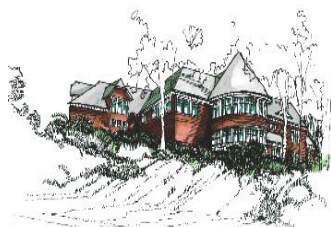
The Bill Library View from Route 117